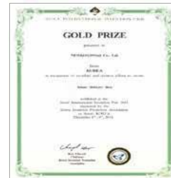
Seoul International Invention