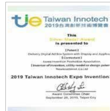
Taiwan International Invention 2019.09.28