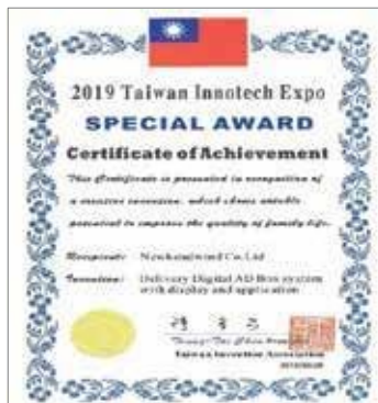
Taiwan International Invention 2019.09.28