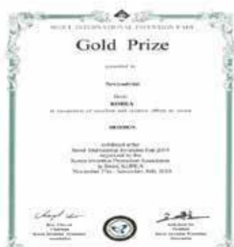
Seoul International Invention 2019.11.27-30