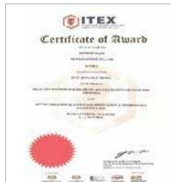
Malaysia International Invention Switzerland International Invention 2019.05.02-04 2019.04.12